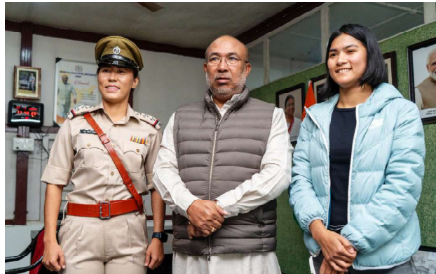
IT News Imphal, Jan 20: