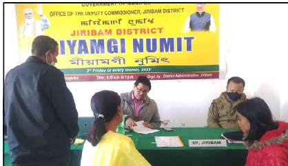
IT News Jiribam, Jan 20:

With a view to establish a better connection between the people with the government and gaining more public trust in district administration and the State Government, the District Administration Jiribam today organized the 7th Meeyamgi Numit (People's Day) in respect of Jiribam District at DC Complex, Chingdong Leikai, Jiribam.